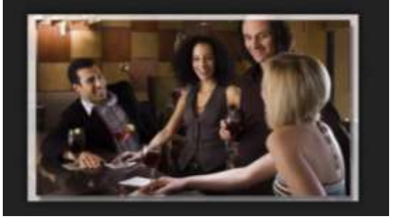
Click the picture above for a 35 second video about the restaurant!